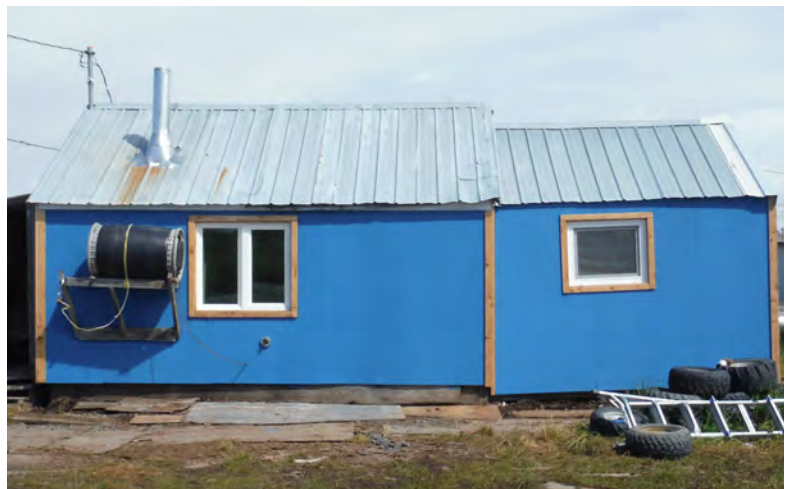
A home in Quinagak is weatherized. Before at left and after is at right.