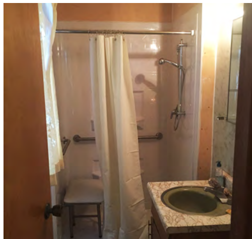
A handicapped-accessible shower was installed in Kotzebue through the Home Modification Program. This program works in conjunction with the Weatherization Program.