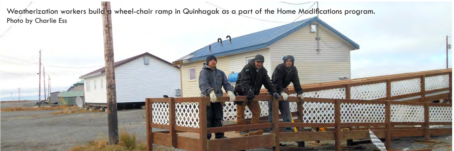
Weatherization workers build a wheel-chair ramp in Quinhagak as a part of the Home Modifications program.