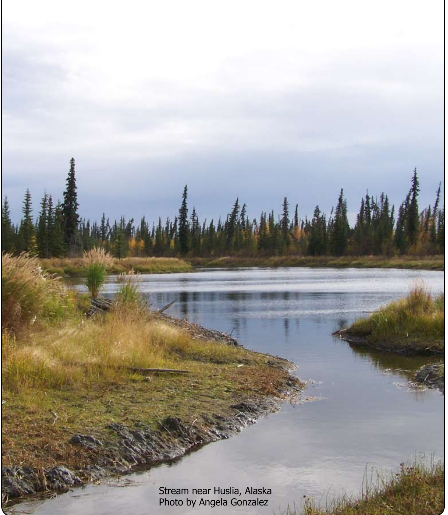
Stream near Huslia, Alaska

Rural Alaska Community Action Program, Inc.