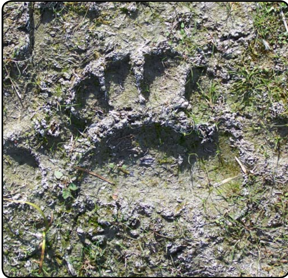
Bear Paw Print in Interior Alaska

This publication lists organizations serving rural Alaskans. No organization has been intentionally excluded from this directory. If you would like your organization listed in future directories please mail or email your contact information to: