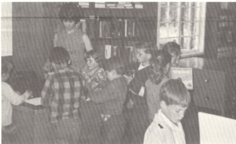
The children of Willow are using the community's first library, constructed with Operation Mainstream funds and donations of work and materials by Willow residents. Books, cases and chairs were donated by Operation Mainstream and RurALCAP.