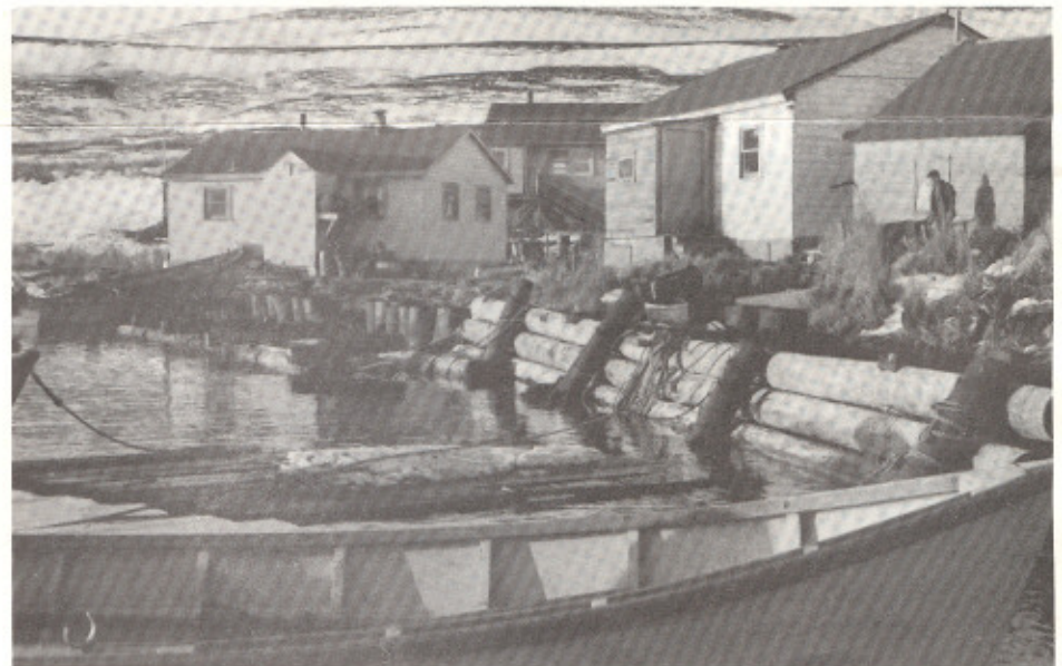
New protection against high water will be provided these Akhiok homes by the new log bulkhead shown here. The project was one of a number of village improvements funded by Operation Mainstream and carried out by Akhiok residents.