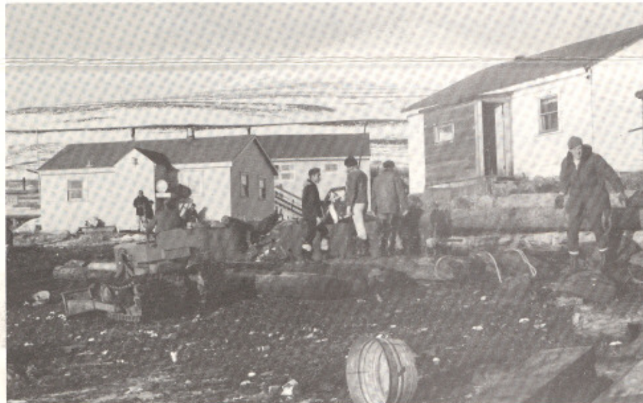
High water periodically flooded these homes in the Kodiak Island village of Akhiok, until a bulkhead was built to deflect the water. Pictured here, the bulkhead project is getting under way funded by Operation Mainstream.

The access road and bridge were badly needed to allow the people of Akhiok to travel to work safely, said Mrs. Gange. "In the past, the people had to surmount many obstacles such as crossing turbulent creek waters or to travel far distances to avoid them in order to get to their work," she said.