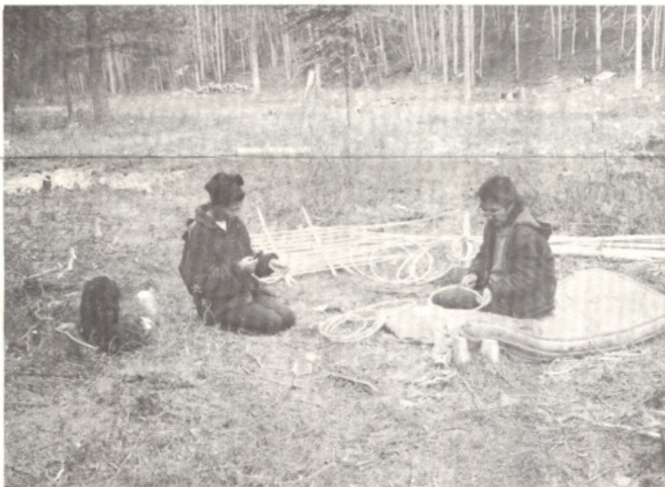
Peeling spruce roots to use in log building construction are these women of Mentasta, workers in a project to create an authentic Indian village for visitors and travellers along the Glennallen highway. The peeled roots tie logs together; traditional log buildings have no nails.