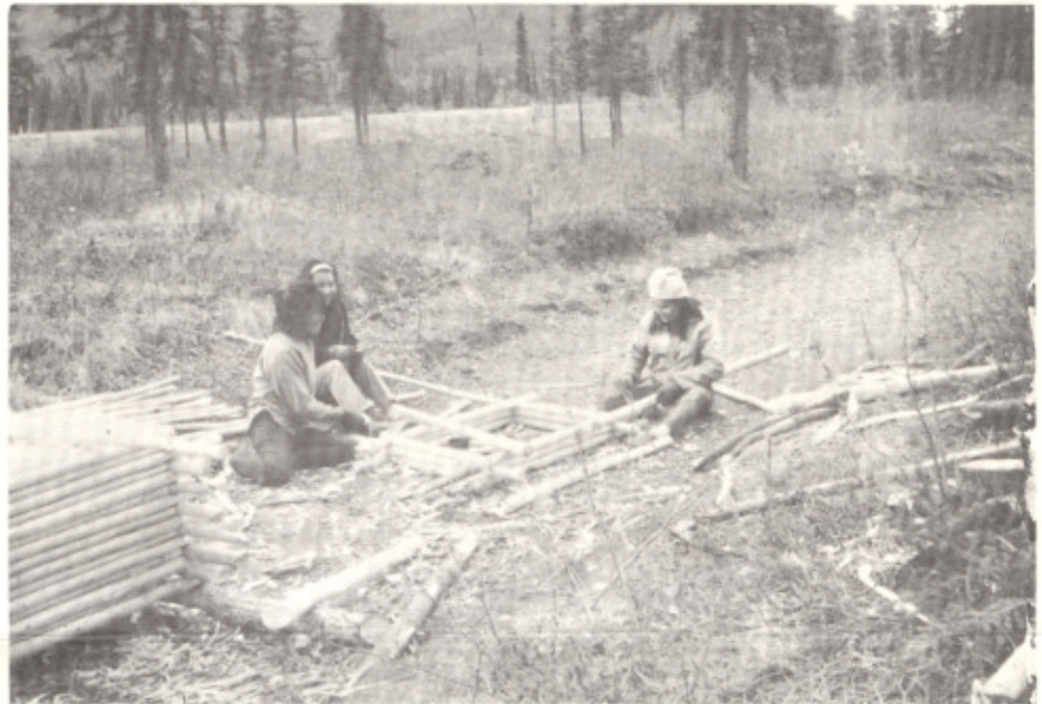
Building a cache and dog houses calls for peeled logs and yards of peeled spruce roots. These women workers are refining their knowledge of traditional Indian crafts in constructing an authentic Indian village near Mentasta.